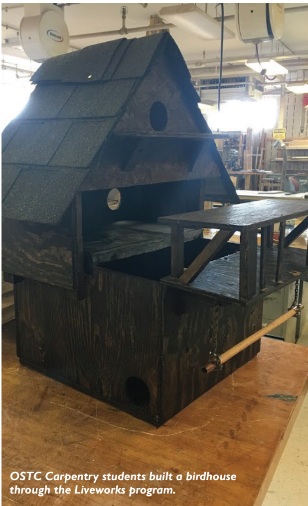
OSTC Carpentry students built a birdhouse through the Liveworks program.