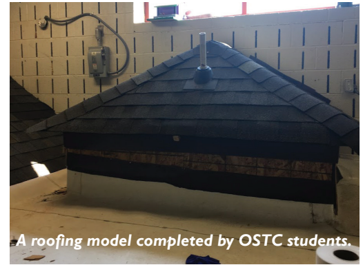
A roofing model completed by OSTC students.