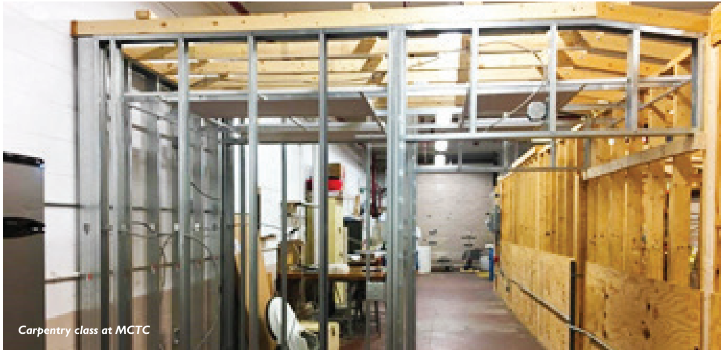
Carpentry class at MCTC

During the 2018-2019 school year, 631 students received Occupational Certificates in the career training programs offered: