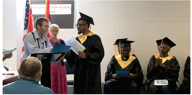
OSTC academic, transition and occupational graduates.