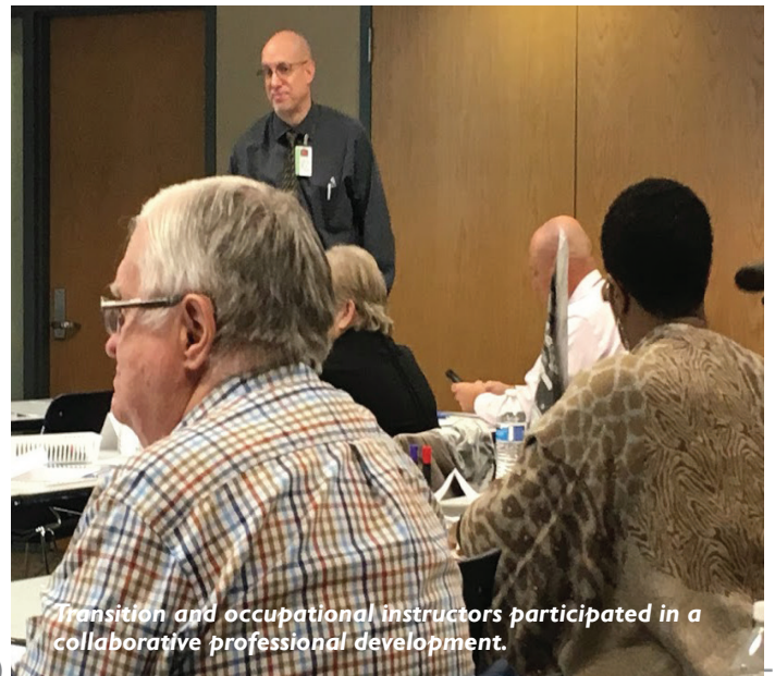
Transition and occupational instructors participated in a collaborative professional development.

Students enrolled in the Business Management Program can earn an additional credential, the Microsoft Office Specialist Certification in Word and Excel. Each program consists of six credit courses taught by Anne Arundel Community College faculty. There are two part-time evening coordinators assigned to the program. AACC has received positive feedback from both the instructors and students about the program and quality of what is being taught. Each student who completes the program receives an AACC Certificate in the program area of completion and participates in a graduation at the facility.