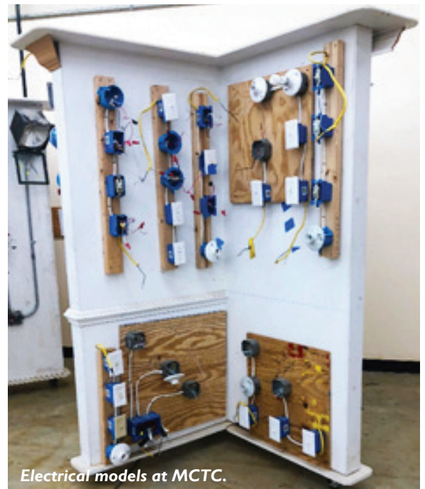
Electrical models at MCTC.