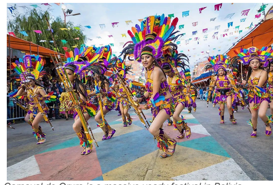
Carnaval de Oruro is a massive yearly festival in Bolivia.

Job Service Specialist Office of Workforce Development and Adult Learning Maryland Department of Labor